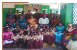
Librarian's Day Celebration in Panjalangapuram Govt. School