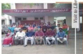
Visit to Libraries in Chennai