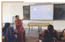
Workshop on ICT Tools for Publishing