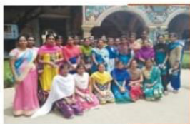
Saraswathi Mahal Library Thanjavur