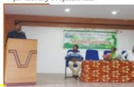
Dilating Knowledge on Open Source Content Management Software