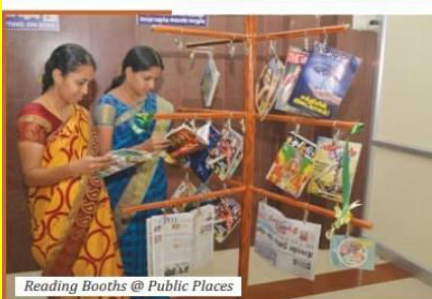
Reading Booths @ Public Places