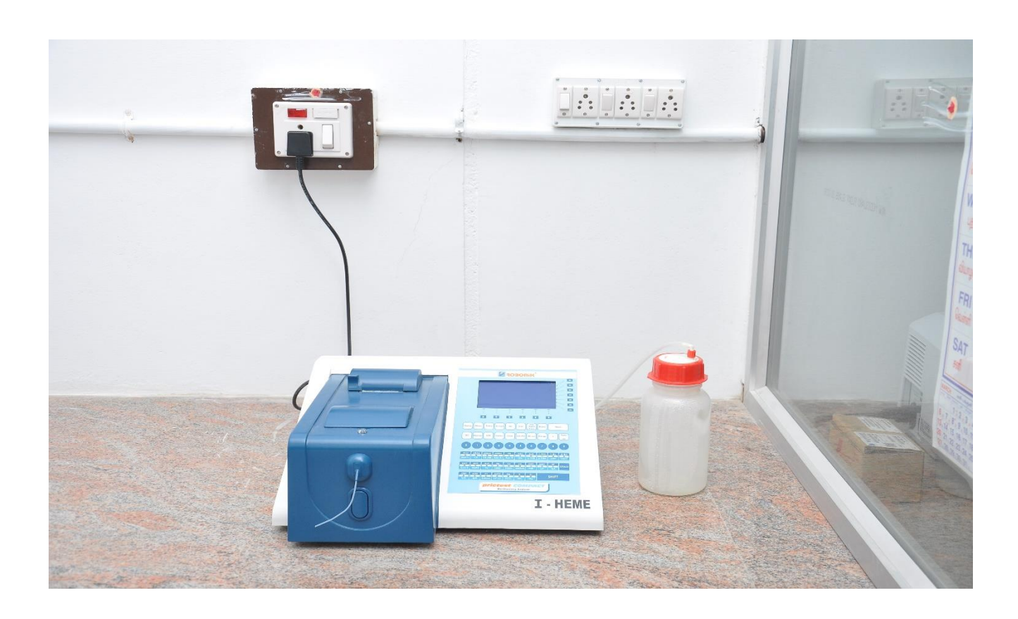
Central Research Laboratory 1