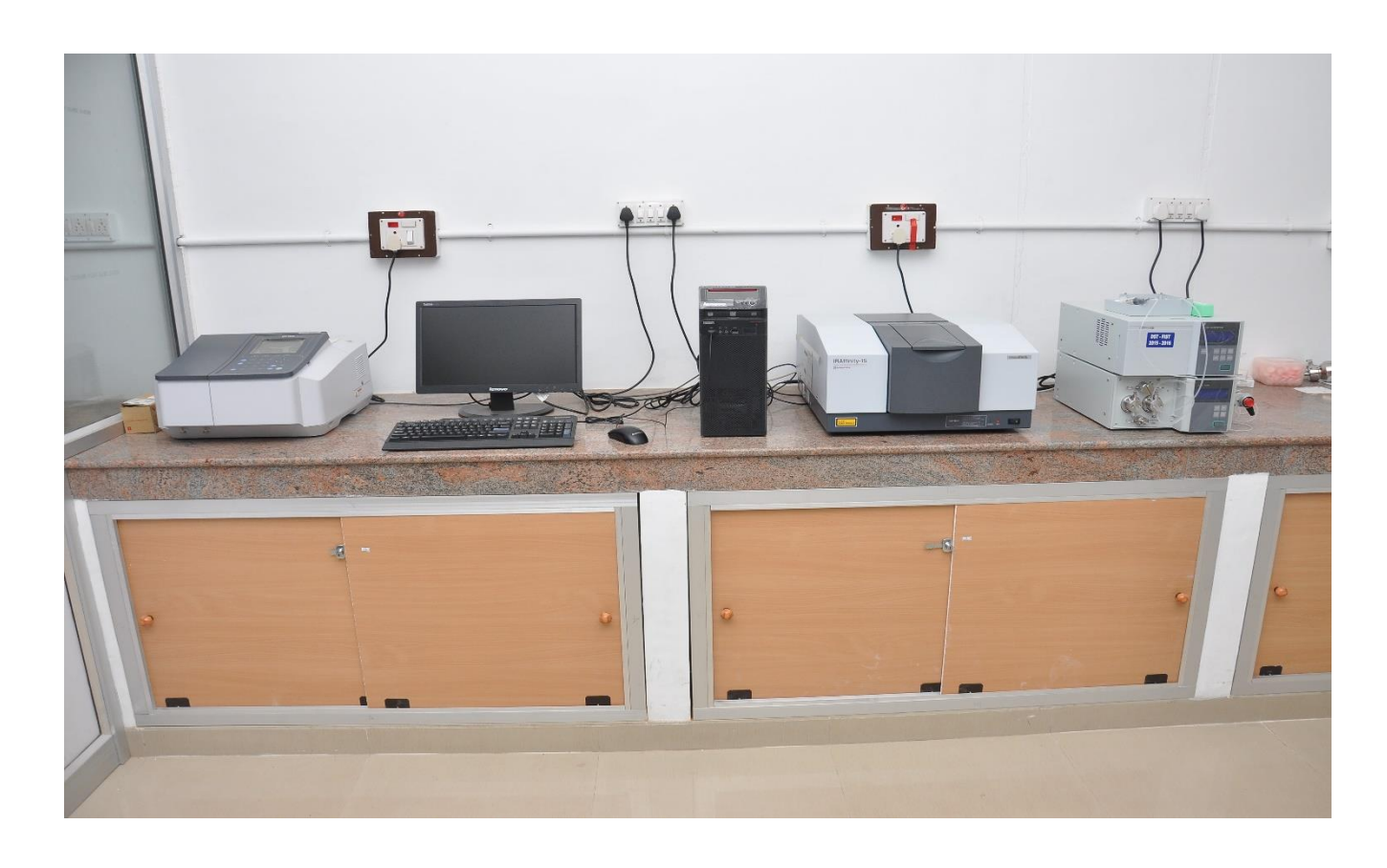
Fourier Transform Infrared Spectrometer